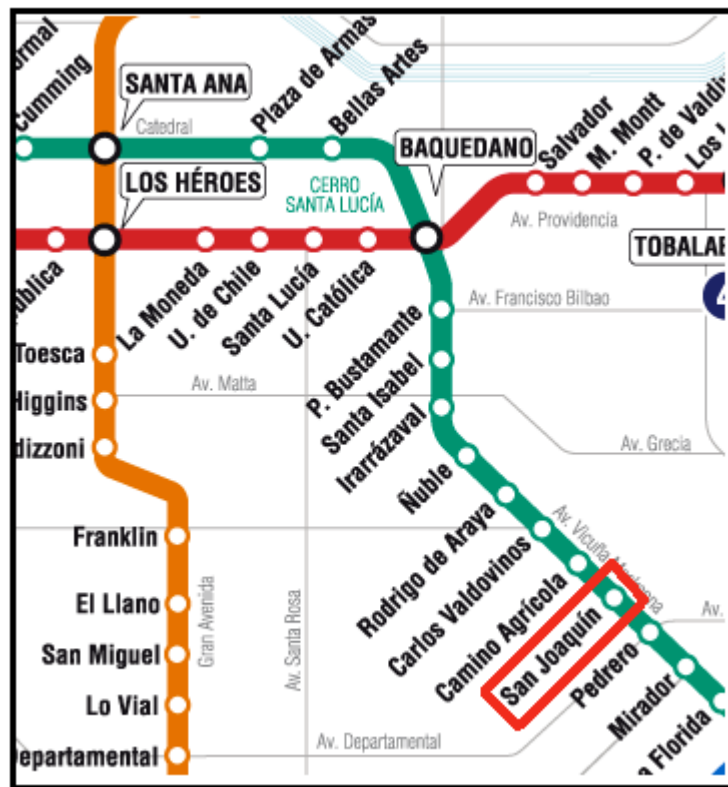
Metro de Santiago map close-up. San Joaquín Station highlighted in red.

The San Joaquín Campus is located next to “San Joaquín” Metro Station (Line 5). This makes of Metro the most common transporting system for students and professors travelling to and from the campus.